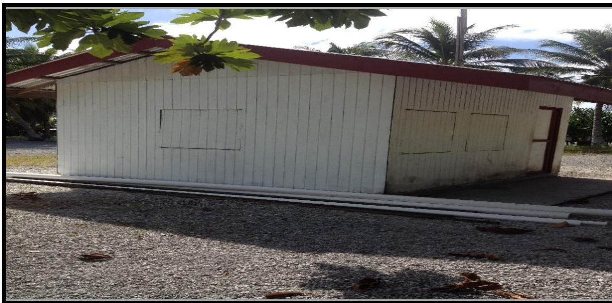
Photo of Call Center on Wotje Atoll

Additionally, we also noted a payment also issued out of the Ministry of Finance per RepMar check no. 101902 on 10/22/12 in the amount of $12,551 for building materials for construction of a Call Center on Wodmej, Wotje Atoll. During our site visit on January 17, 2015, we noted that the Call Center complex appears small.