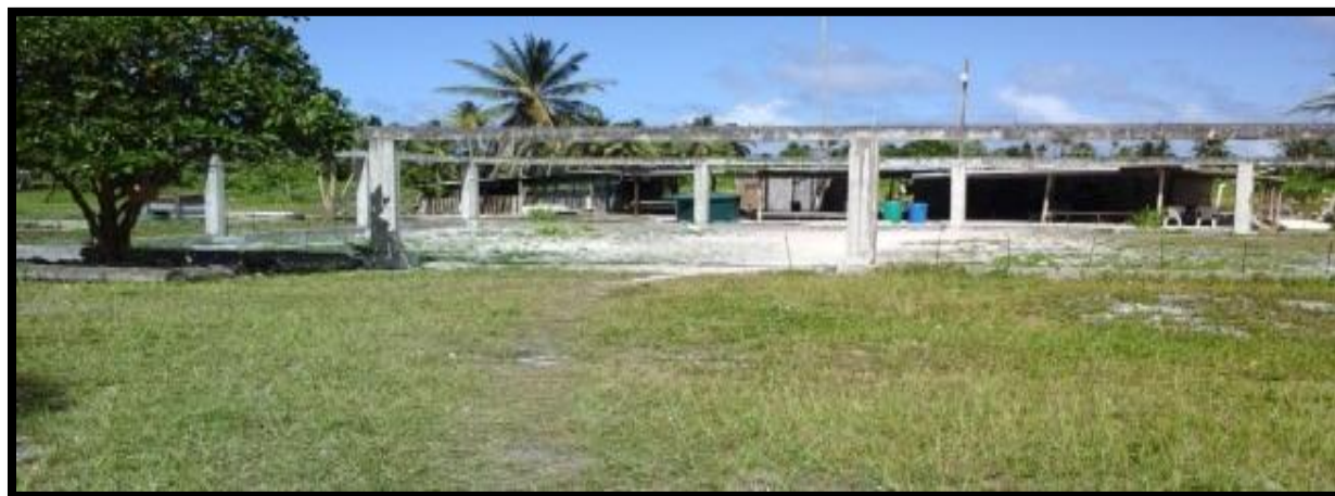
Photo of church funded by Grant-In-Aid

Cause: The cause of the above condition is that the Council of WALGOV did not carry out their responsibility by making sure that the building materials purchased for this project were delivered to the project site and used according to approved proposal. Additionally, the Local Government Affairs Office and Grand-In-Aid Project Officer did not carry out their responsibility to oversee and require that all projects funded in part through the Grant-In-Aid funds be completed as approved.